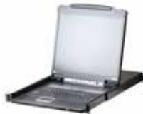
CL5708i LCD KVM over IP switch